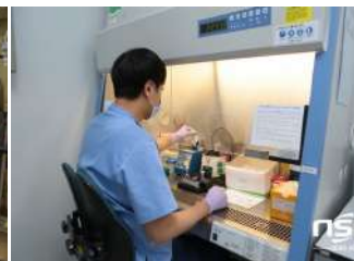
the FIRST Testing System for Viral Respiratory Infection in Korea introduced by YUMC (2017)