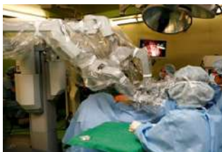
INTUITIVE SURGICAL's Da Vinci X The best robotic surgical system for procedures in the lower abdomen (2013)