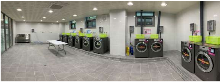
Laundry Room in Student Dormitory