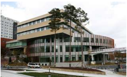
YUMC Regional* Respiratory Center *Southeastern Korea