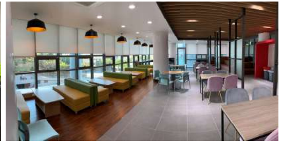
Multi-zone in Student Dormitory