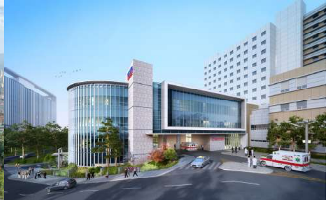
YUMC Regional* Emergency Medical Center