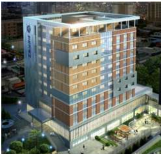
Student Dormitory (new)