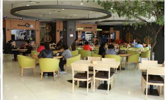
YUMC cafeteria for patients & visitors