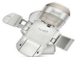
Varian's VitalBEAM® Sophisticated treatment delivery system with innovative beam generation (2019)