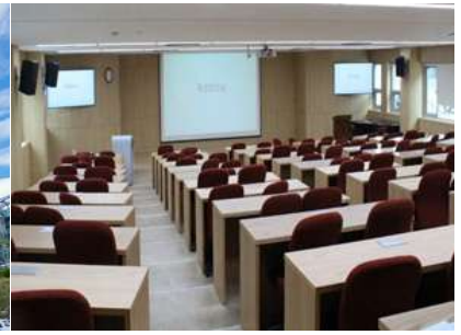
High-tech Lecture Room