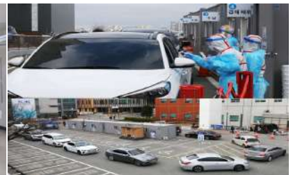
the FIRST Drive-thru COVID-19 Testing Center in Korea introduced by YUMC (26 Feb. 2020-present)