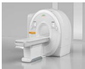
SIEMENS's MAGNETOM Vida the best 3T MRI Scanner (2020)