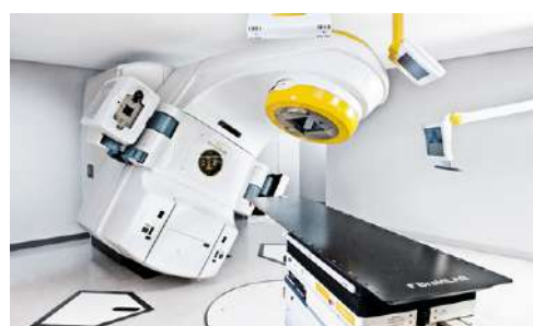
Varian & BrainLAB's Novalis TX® the World's Most Powerful and Versatile Stereotactic Radiosurgery System (2012)