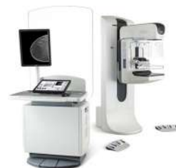
Hologic's Selenia Dimensions 3D™ A 3D mammography system offering Tomosynthesis technology accredited by USFDA the first in the world (2020)