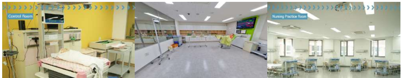
Simulation Center in the Department of Nursing