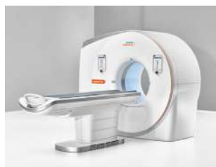
SIEMENS's SOMATOM Force 192-slice Dual Source CT (2020)