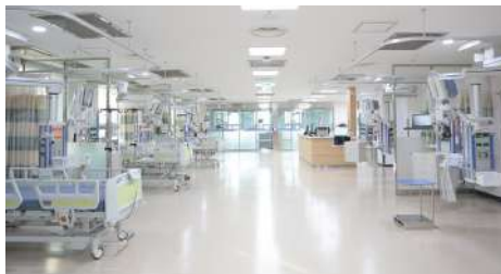
YUMC's Surgical Intensive Care Unit renovated in 2020