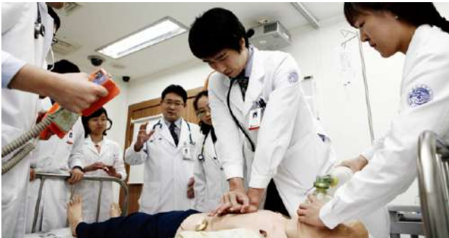
Clinical Skill Training Center in the College of Medicine