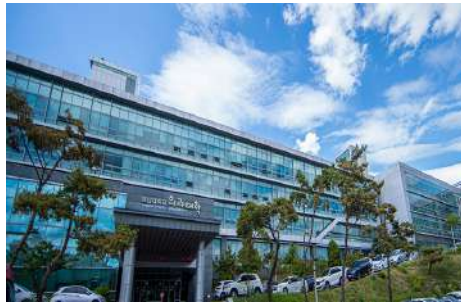
Main Building of College of Medicine